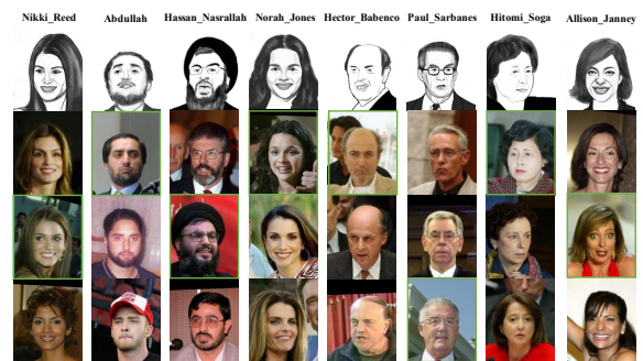
Figure 3: Some retrieval result of proposed approach.