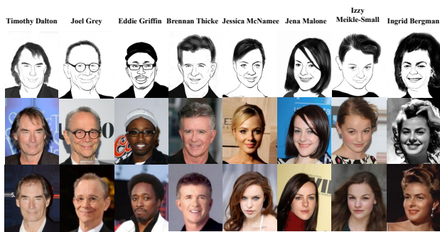
Figure 1: An overview of our training data.

Our training data used in experiments are shown below. There are 10,001 sketches from 10,001 person in total. (1)The first row is the sketches drawn by human painters. The photos given to painters for drawing are selected from MS-Celeb-1M (Guo et al. 2016). (2)The second row is corresponding photos of drawn sketches. (3)The last row is another photo with the same ID.